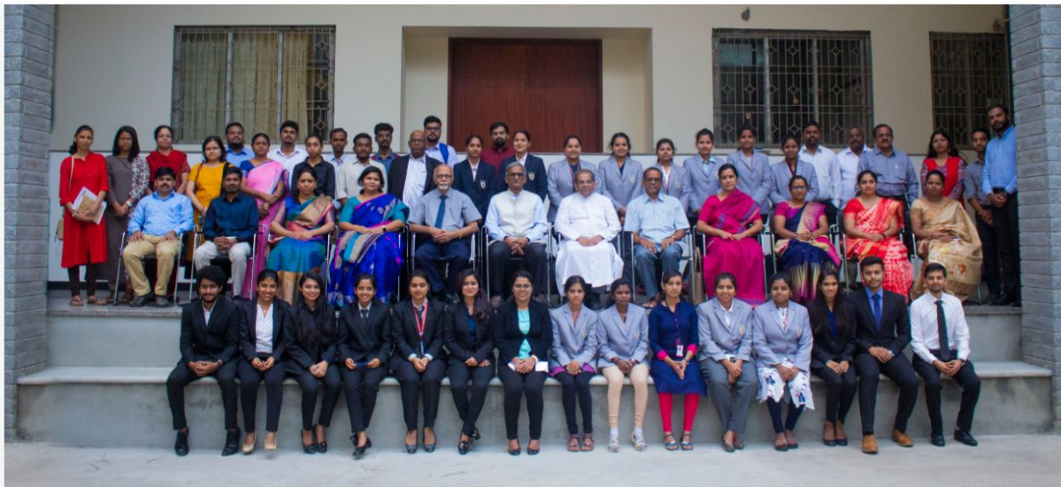
Participants of the UGC Sponsored National Level IQAC Conference on “Quality Initiatives in Teaching, Learning and Evaluation Processes in Higher Educational Institutions” on 24th August 2018.

Organized by Internal Quality Assurance Cell (IQAC)