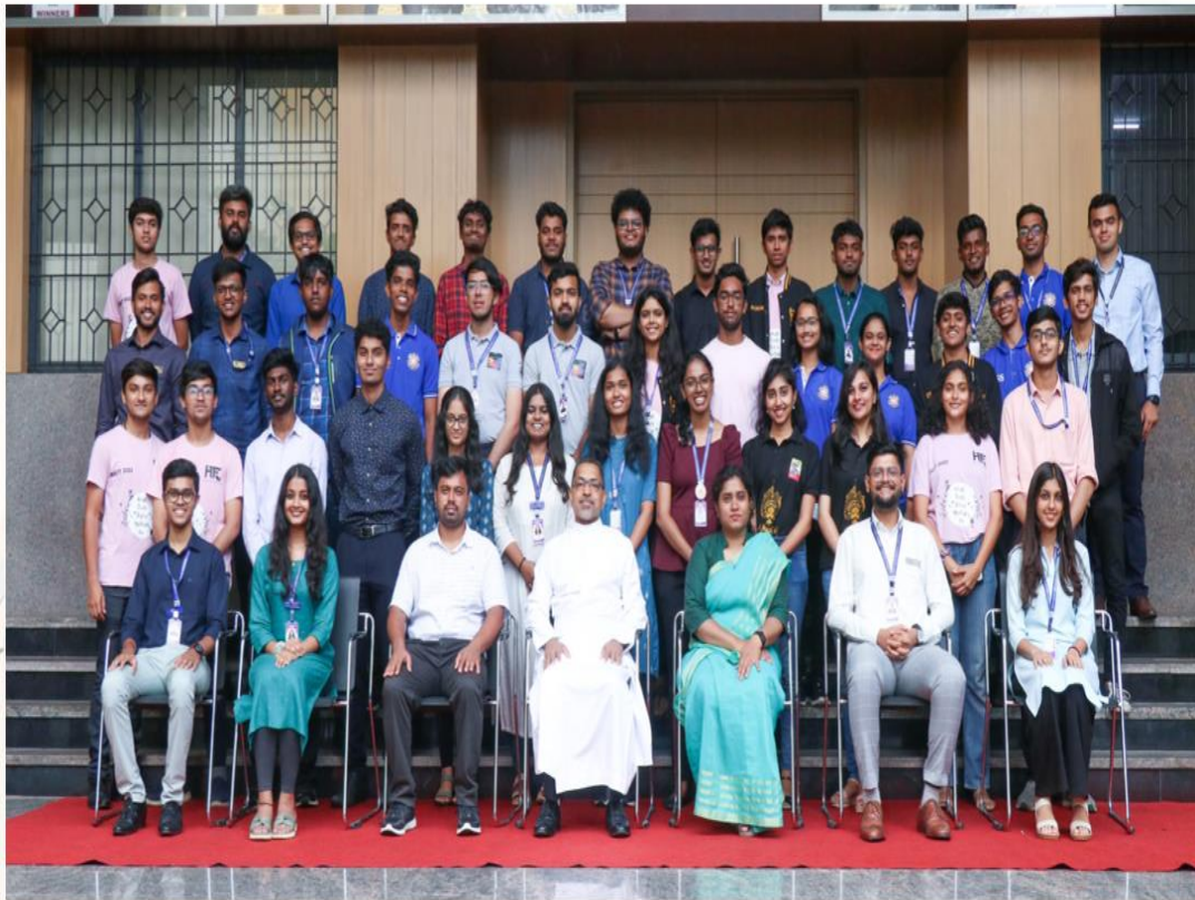
Bambala (Outreach Team)