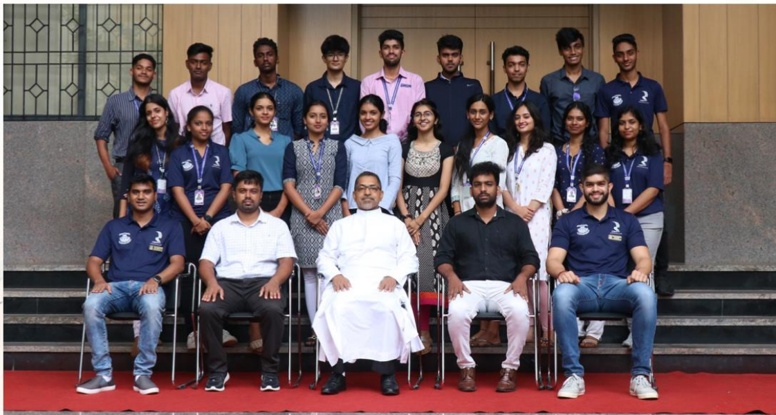
Centre for Social Action (CSA)