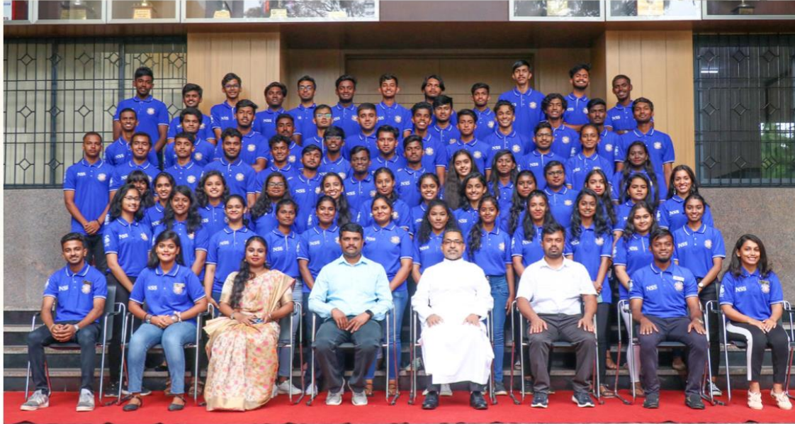
National Service Scheme (NSS)