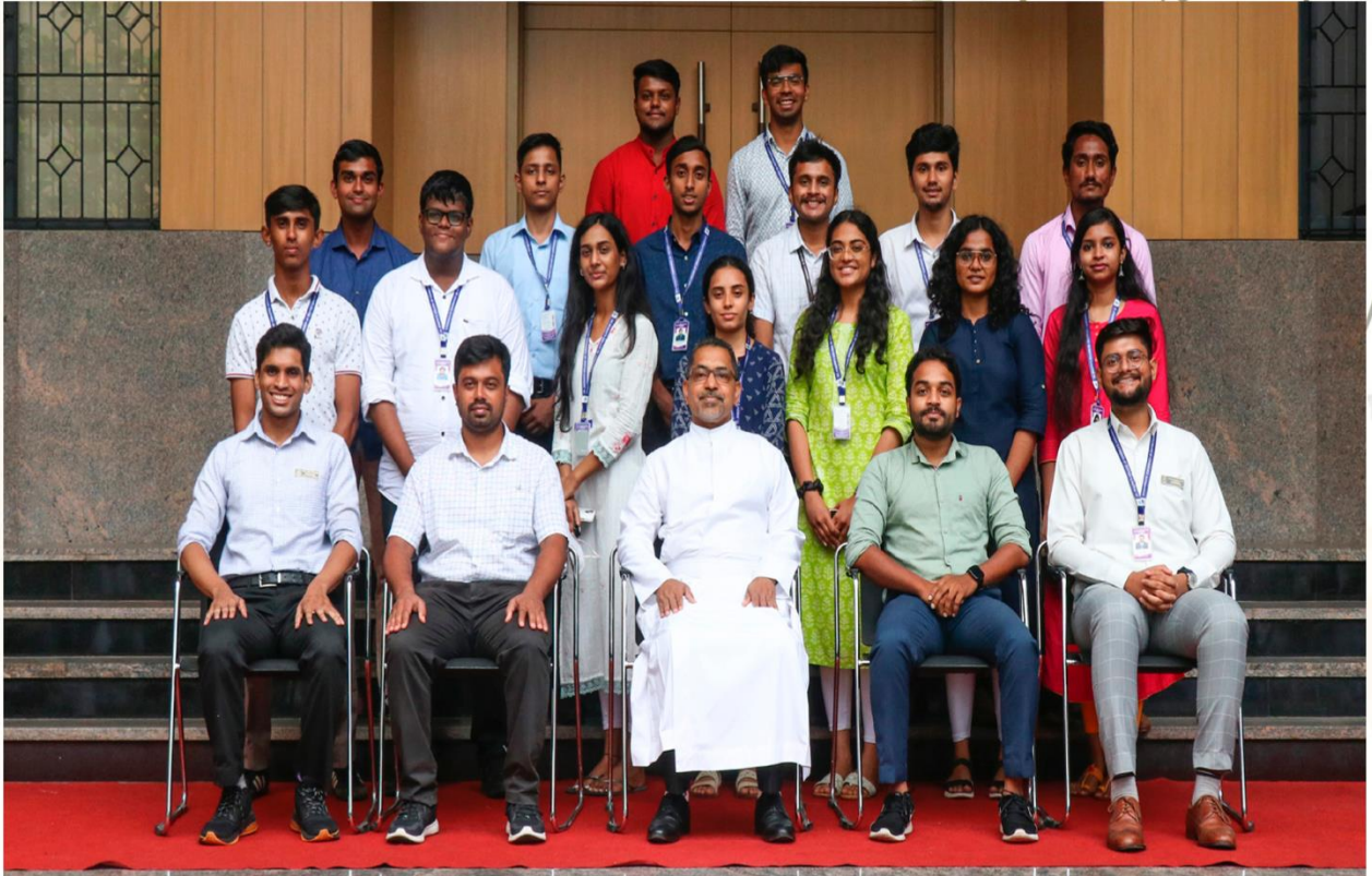
YDC- Youth for Democracy and Constitution