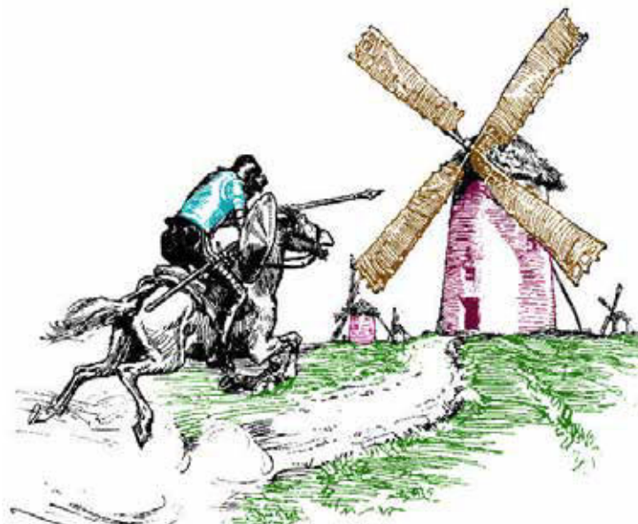
Don Quixote fighting windmills. From Stories of Don Quixote: Written Anew for Young People (page 80), published in 1910 (source), written by James Baldwin and illustrated by G.A. Harker. (Wikimedia Commons)

The language lab at SJCC is equipped with a language learning software. This facility plays an important role in the success of our students in national and international language proficiency exams.