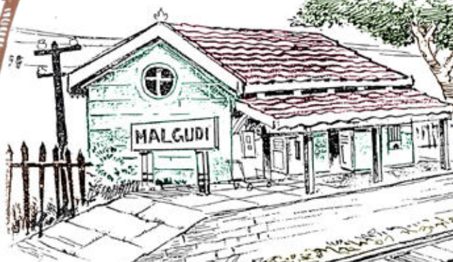
Sketch by R. K. Laxman for the popular TV series 'Malgudi Days'.