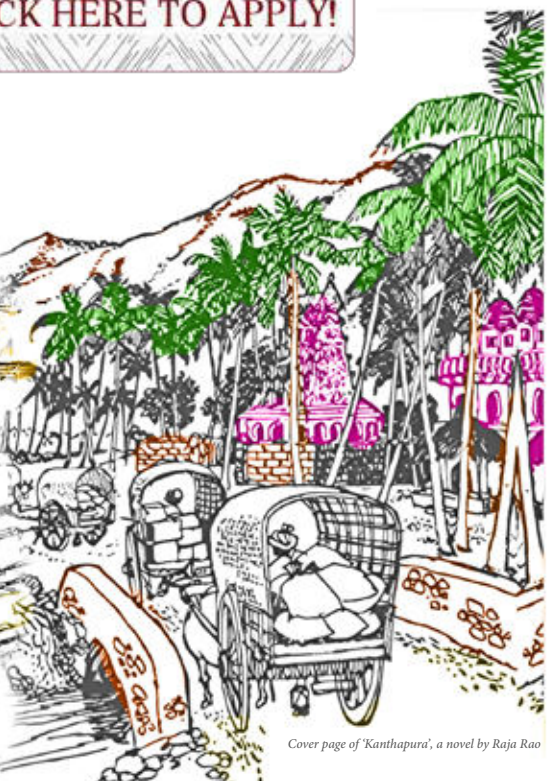
Cover page of 'Kanthapura', a novel by Raja Rao