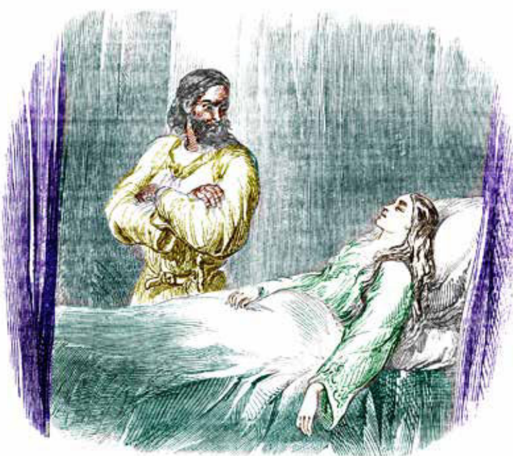
Othello.—"IT IS THE CAUSE—IT IS THE CAUSE, MY SOUL."—ACT V, SCENE 2.