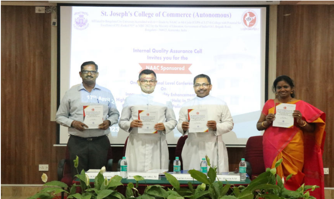
Release of Conference Compendium of the National Conference 2023