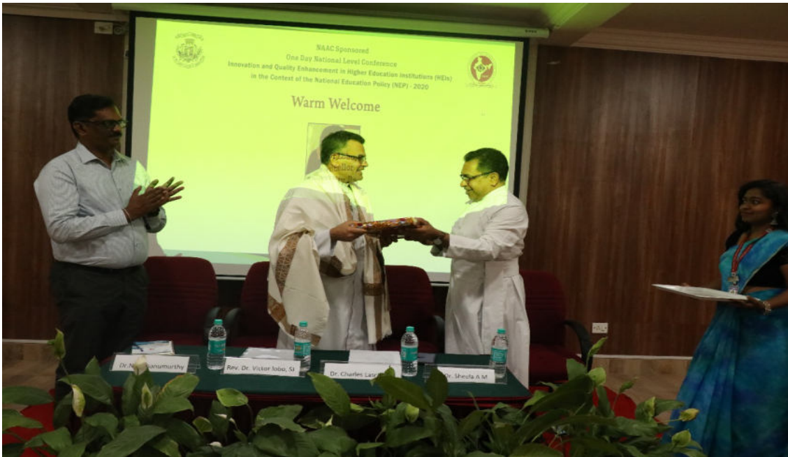
Felicitation of the Chief guest