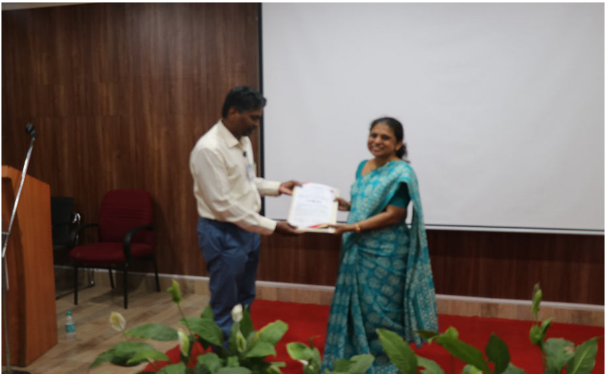
Participants receiving certificates