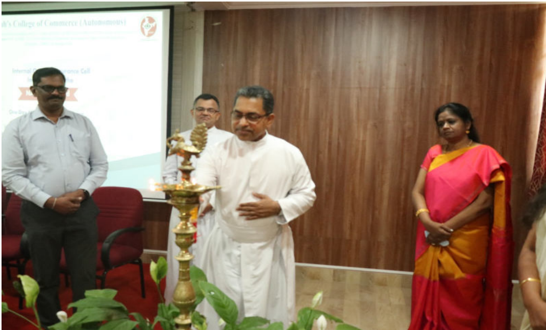
Lighting of lamp by the Dignitaries