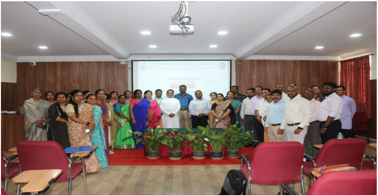
Participants at the conference