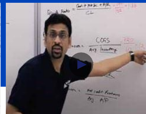
Section B Long-Term Financial Management