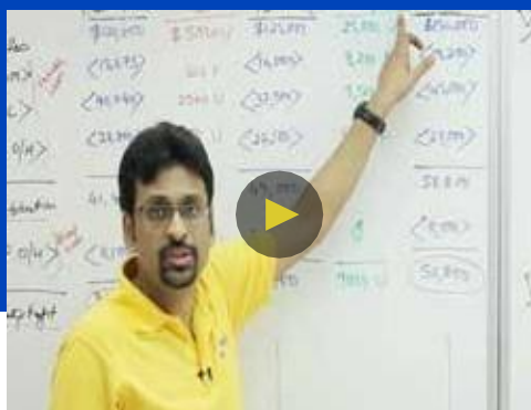
Section B Forecasting Techniques