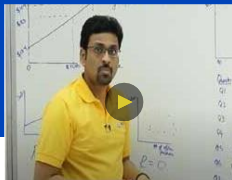
Section C Cost & Variance Measures