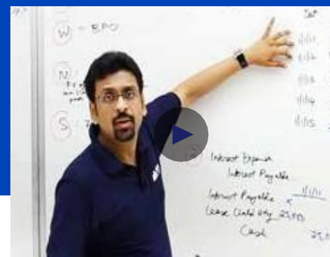
Section A Working Capital Analysis