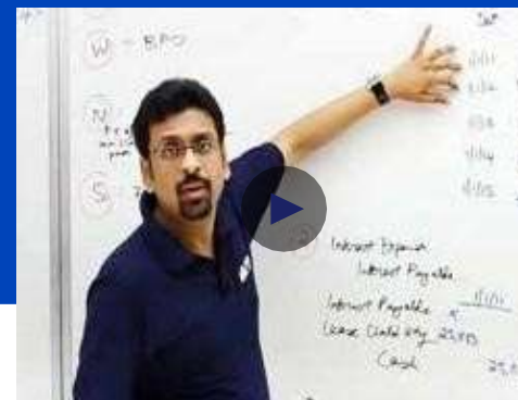
Section A Working Capital Analysis