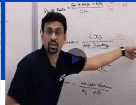
Section B Long-Term Financial Management