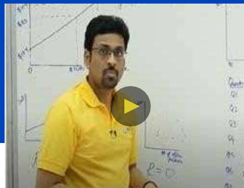
Section C Cost & Variance Measures