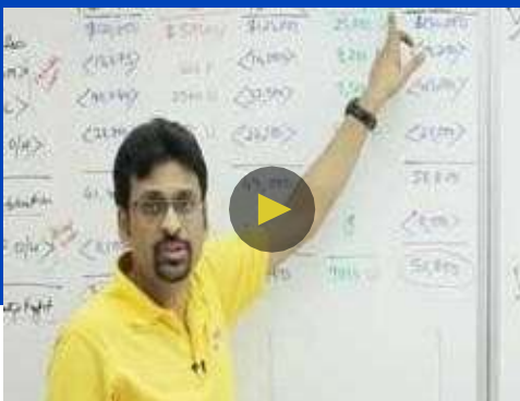
Section B Forecasting Techniques