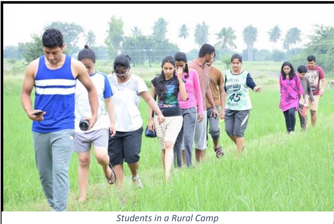
Students in a Rural Camp

The following were the activities that took place in the odd semester: