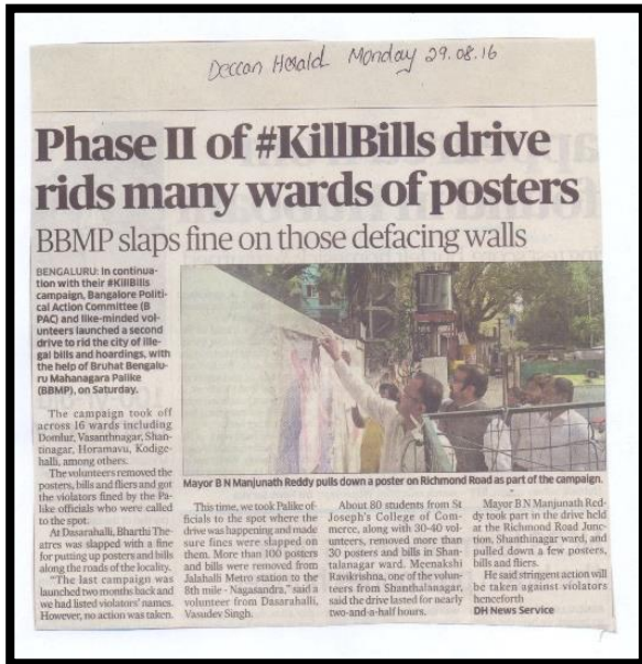
Newspaper reports of KillBill drive conducted by students.