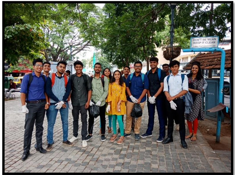
Students taking part in cleanliness drive